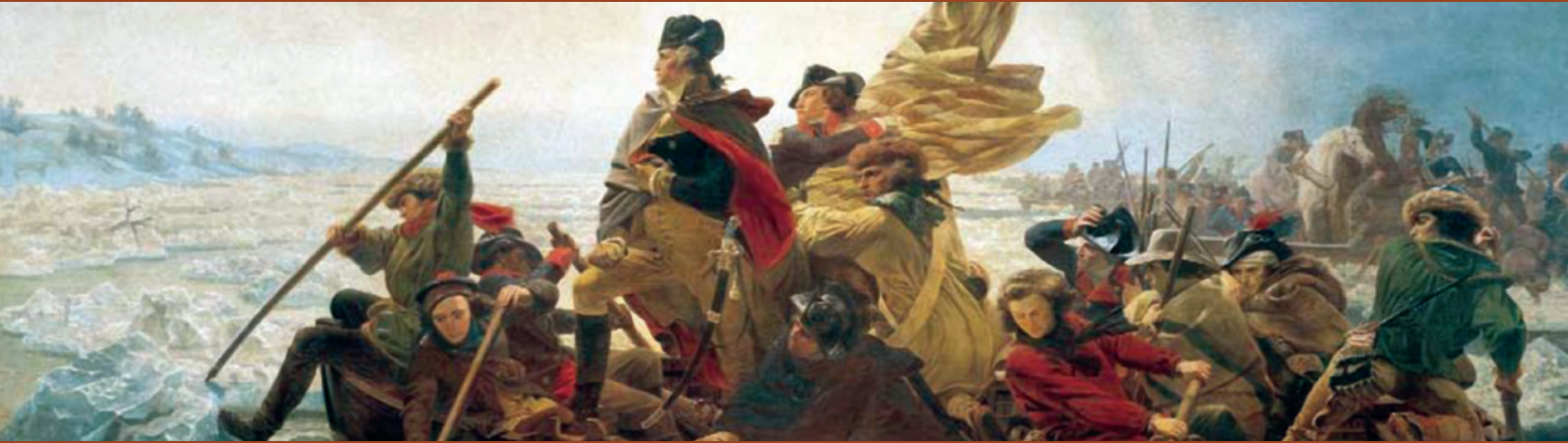
Image Credit: Emanuel Leutze, Washington Crossing the Delaware, 1851 Emanuel Leutze (American: 1816-1868), Washington Crossing the Delaware, 1851, Oil on canvas; 149 x 255 in.: The Metropolitan Museum of Art, Gift of John Stewart Kennedy, 1897 (97.34) "

AMERICA'S HISTORY THROUGH OUR NATION'S ART