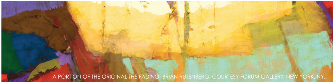
A PORTION OF THE ORIGINAL THE FADING , BRIAN RUTENBERG, COURTESY FORUM GALLERY, NEW YORK, NY.